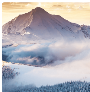
Misty Mountain Sierra