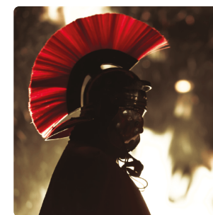
I am Warrior!